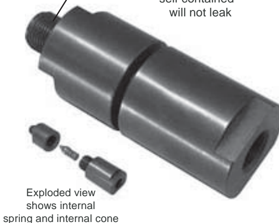
Exploded view shows internal spring and internal cone